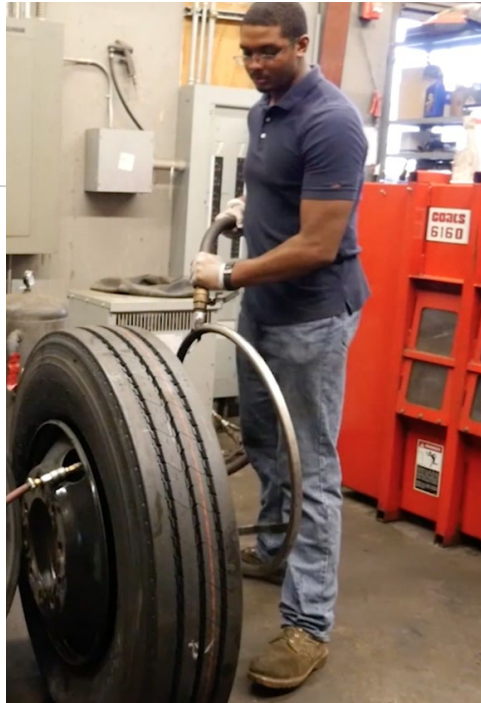
Corporate Classroom student interning in the district's Fleet Maintenance Department

Internship and paid sites within the school district: