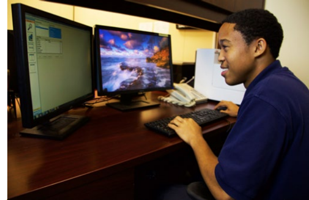
Corporate Classroom student interning in the district's Records Room